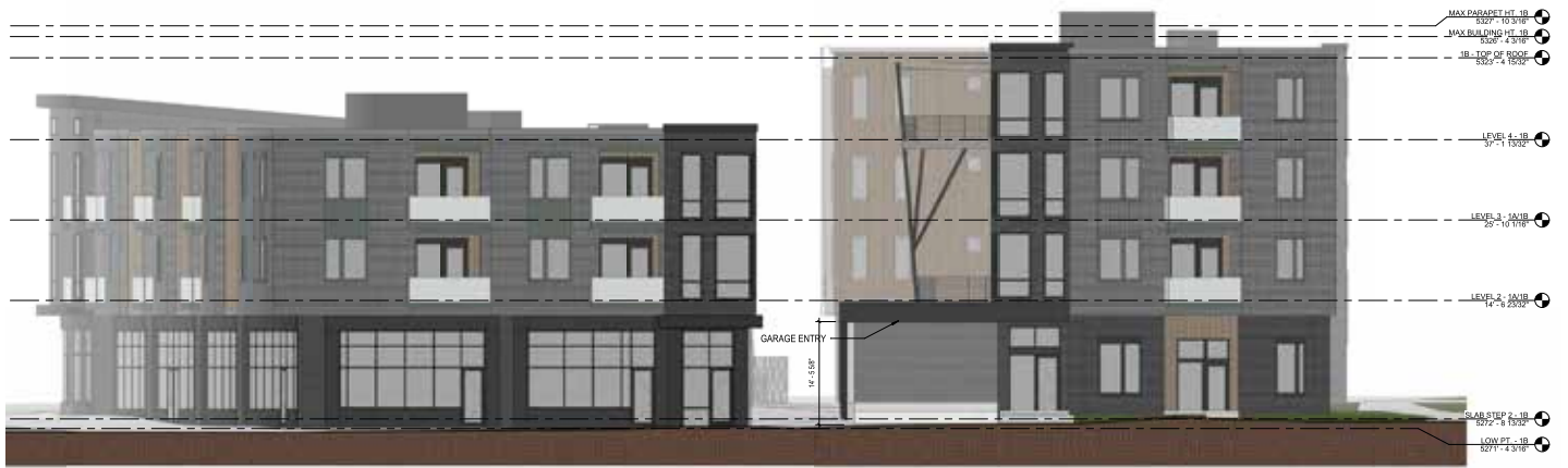
1A - 1B EAST ELEVATION - GARAGE RAMP CANOPY